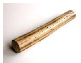
An example of a traditional rainstick made from a dried cactus tube.

A rainstick belongs to the percussion family of instruments. A percussion instrument is anything that requires an action such as being shaken or struck for enough vibration to produce a sound. Originally rainsticks were used as ceremonial instruments to invoke the rain spirits, but in recent years they have been included more often in percussion ensembles.